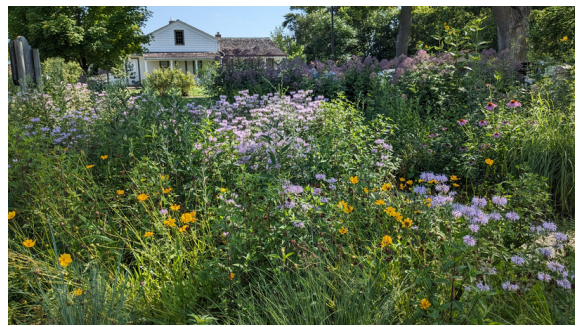
Native plant landscaping Sheldon Peck House, Lombard