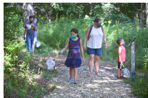
Looking for butterflies Fox Valley Park District

2023 - 1,700 fifth graders learned about pollinator habitat at Red Oak Environmental Education site