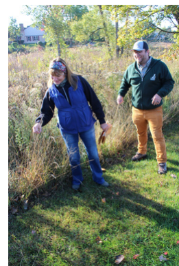
Make a Difference Day Bloomington Park District