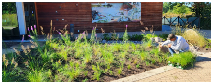
Knoch Knoll Nature Center Naperville Park District

2022 - Scouts, youth volunteers and adults volunteered to plant at Hobson West Ponds