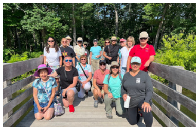
Darien Garden Club walking group

2022 - Habitat: maintenance continues at St John Pollinator Garden, Darien Milkweed Patch, habitat at Aspired Living of Westmont