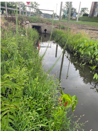
Restored area along St. Josephs Creek Westmont