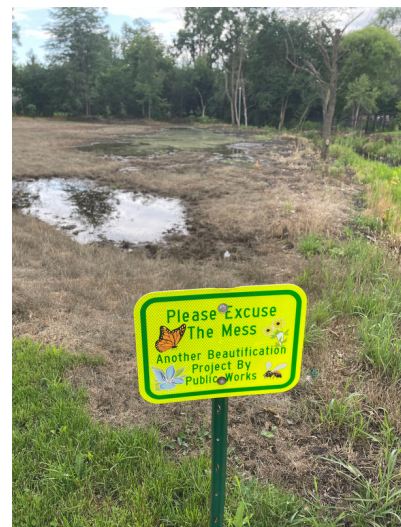
Westmont Park District

2017 - This new facility will be located on the unused 0.15 acre Village public road right of way, between the Village of Clarendon Hills Public Works facility and the Downers Grove Township Highway Garage, south of the Burlington Northern Santa Fe (BNSF) Railroad. This right-of-way is owned by both the Village of Clarendon Hills and the Village of Westmont. Once completed, the Gardens will provide a new place in our communities to promote education programs about natural and organic gardening methods and our environment.