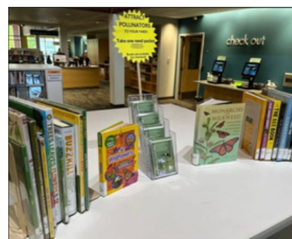
Book display at the Warrenville Public Library

2023 - Display of books in May related to monarchs and native plants with packets of free seeds.