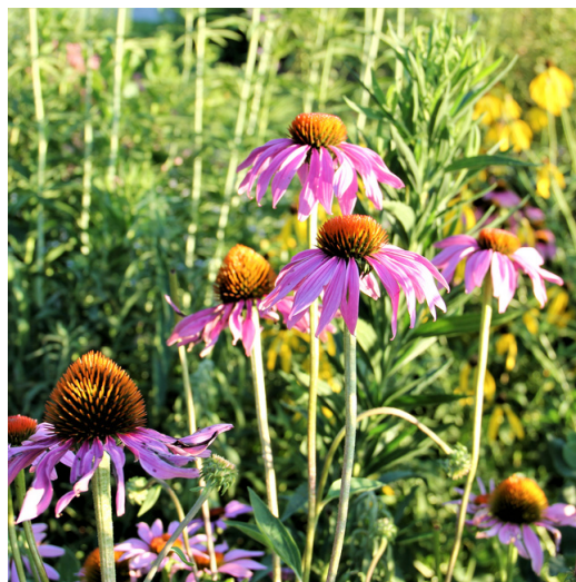
Prairie Path butterfly garden planted by Warrenville in Bloom

2023 - Routine maintenance of natural areas and landscape plantings