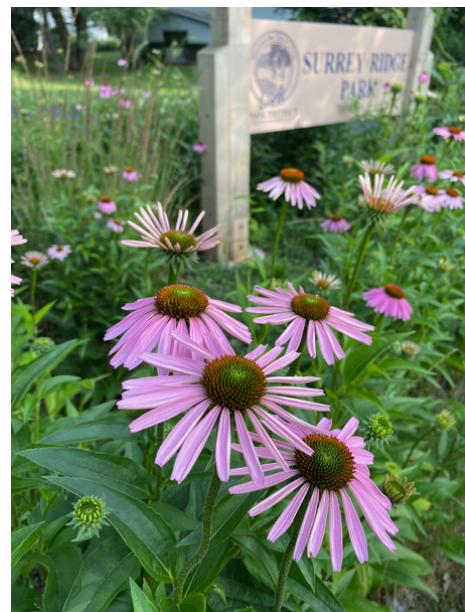
Purple coneflower Lisle Park District

2021 - collected acorns and are preparing to grow 500 seedlings