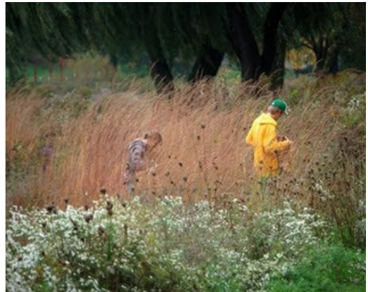
Collecting seed TerraceView Park Lombard

2023 - sponsored No Mow 'til Mothers Day