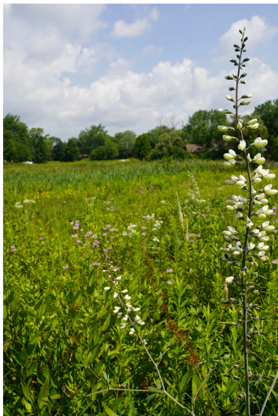
Churchill Park Glen Ellyn Park District

2023 - began planning for a native plant propagation center