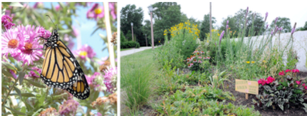
Villa Park butterfly garden maintained by the F.U.N Commission 2022

2017 - In collaboration with the Villa Park Economic Commission, Environmental Commission, Kenilworth Watch Group, Community Pride Commission, Villa Park Garden Club, The Conservation Foundation and DuPage Monarch Project planted five butterfly gardens along the Great Western Trail.